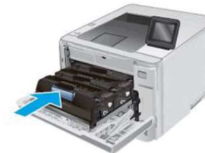
Figure : Pushing the toner cartridge drawer into the printer