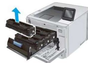
Figure : Removing the toner cartridge