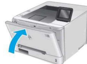
Figure : Closing the toner cartridge drawer