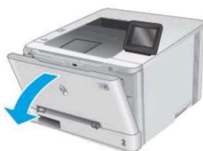
Figure : Opening the front door